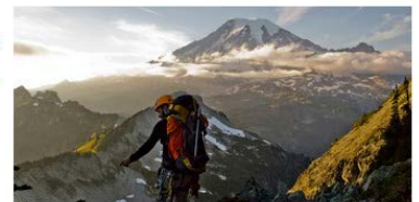
Unicorn Peak

That is the ambitious mission of The Outdoor Project , a new online guidebook for nature-lovers, hikers, and adventurers. The website—which went live this week and officially launches on Monday—offers 331 trips for all types of adventurers, with more on the way.